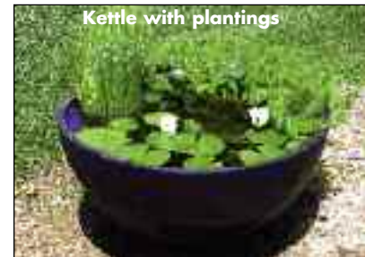
Kettle with plantings

Kettles are also available in JADE STONE Color (shown at left)