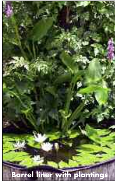
Barrel liner with plantings